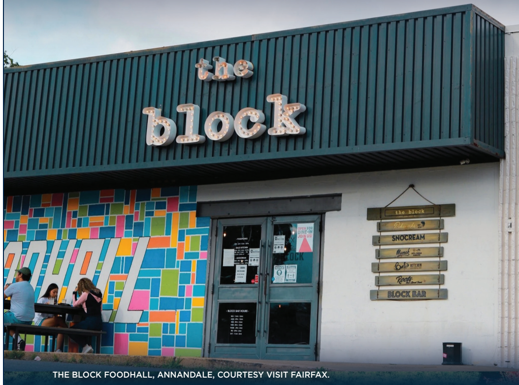
THE BLOCK FOODHALL, ANNANDALE, COURTESY VISIT FAIRFAX.

EMPLOYMENT IN THIS AREA IS CONCENTRATED IN FOUR SECTORS: HEALTH CARE AND SOCIAL ASSISTANCE, RETAIL TRADE, EDUCATION AND PROFESSIONAL SERVICES.