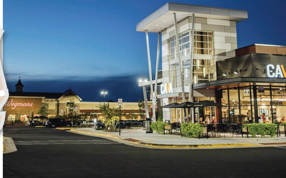
THE FIELD AT COMMONWEALTH PROVIDES VARIOUS DINING AND RETAIL SERVICES TO THE OFFICE WORKERS AND NEW RESIDENTIAL COMMUNITIES IN WESTFIELDS, INCLUDING A WEGMANS. (PHOTO COURTESY REGENCY CENTERS)

SOURCE: FCEDA YEAREND 2022 REAL ESTATE REPORT