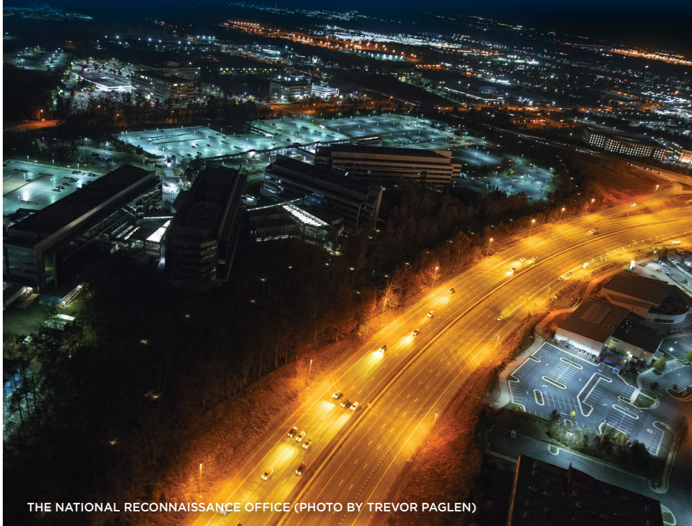
THE NATIONAL RECONNAISSANCE OFFICE

NUMEROUS GOVERNMENT CONTRACTORS MAINTAIN OFFICES IN THIS AREA FOR EASY ACCESS TO FEDERAL GOVERNMENT CLIENTS THAT INCLUDE THE NATIONAL RECONNAISSANCE OFFICE, THE CIA AND THE FBI.