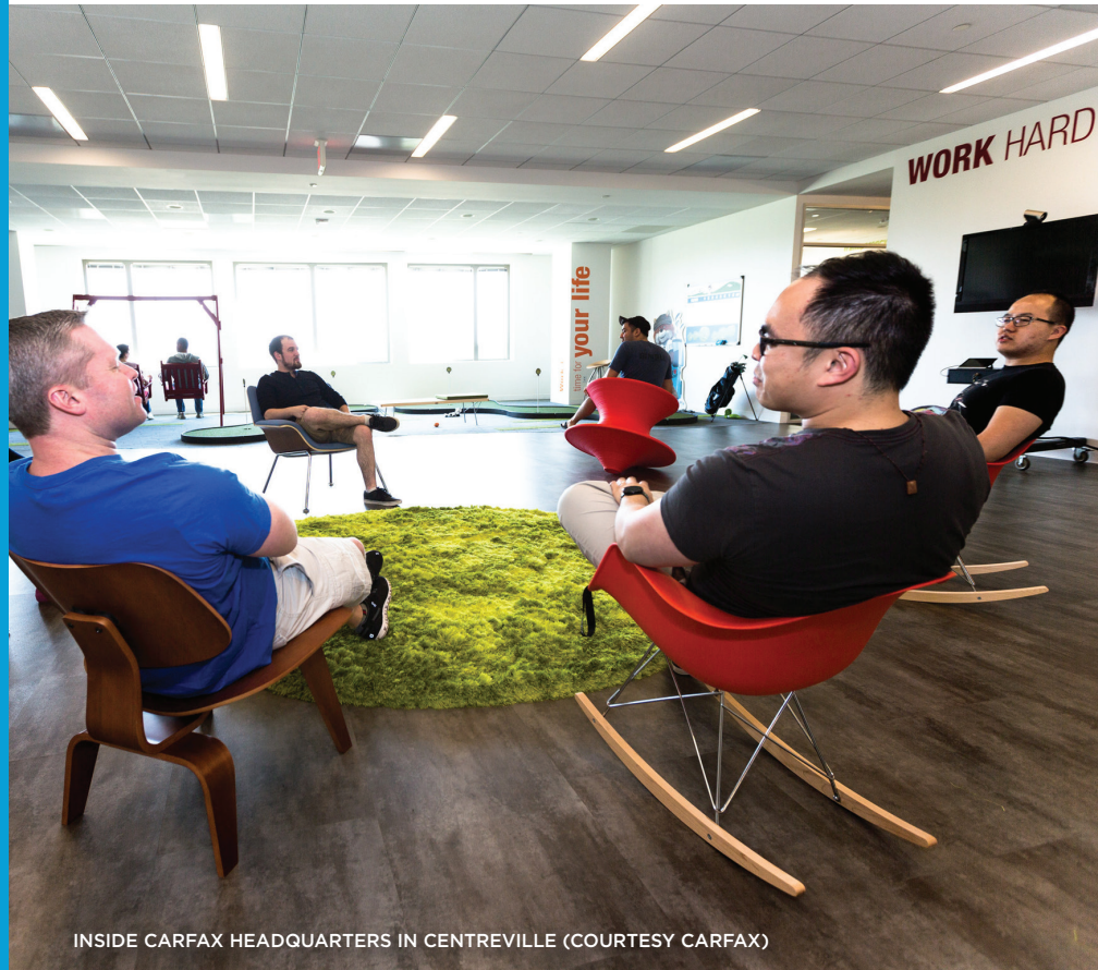
INSIDE CARFAX HEADQUARTERS IN CENTREVILLE