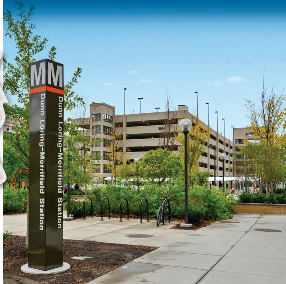
DUNN LORING-MERRIFIELD METRO AREA IS UNDERGOING MAJOR REDEVELOPMENT

SOURCE: FCEDA YEAREND 2022 REAL ESTATE REPORT