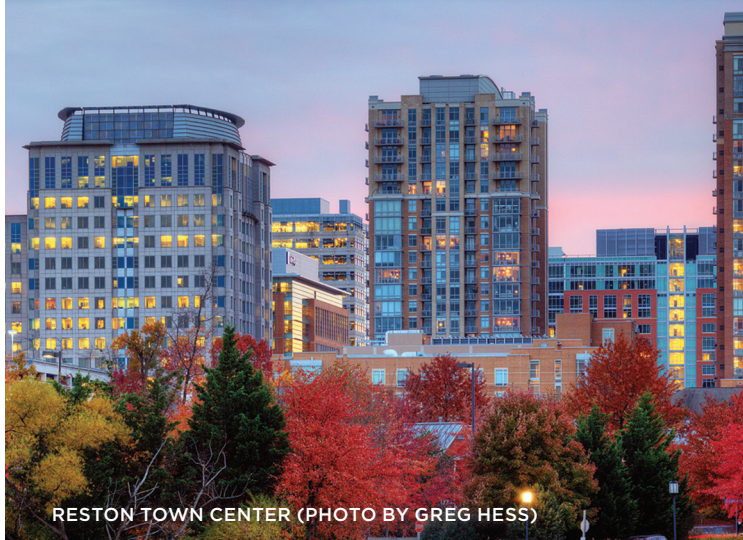
RESTON TOWN CENTER

CHAMBERS OF COMMERCE AND BUSINESS GROUPS