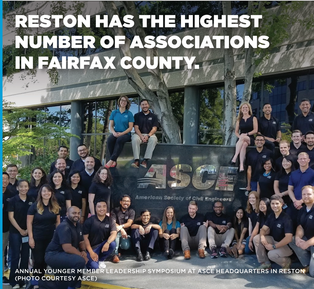
ANNUAL YOUNGER MEMBER LEADERSHIP SYMPOSIUM AT ASCE HEADQUARTERS IN RESTON