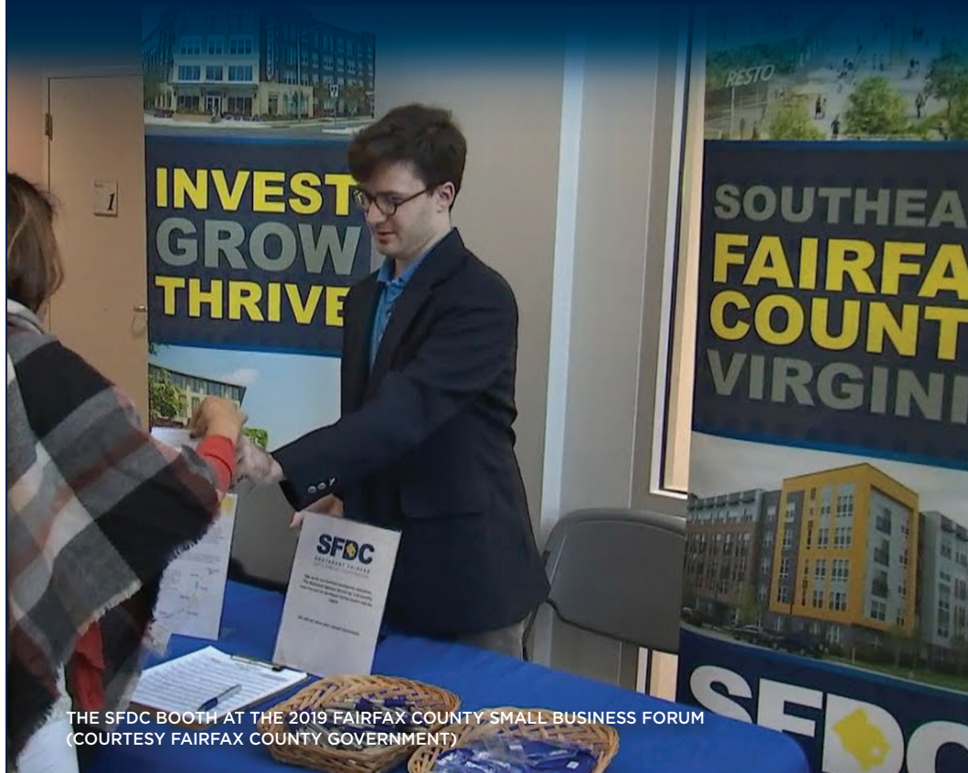
THE SFDC BOOTH AT THE 2019 FAIRFAX COUNTY SMALL BUSINESS FORUM

SMALL BUSINESS CAPITAL: MORE THAN 95 PERCENT OF BUSINESSES IN THE RICHMOND HIGHWAY AREA HAVE FEWER THAN 50 EMPLOYEES.