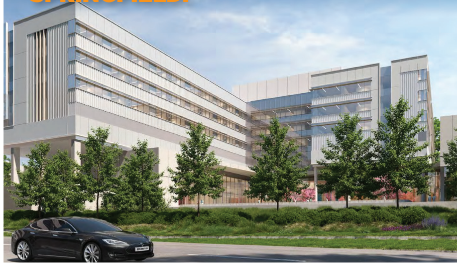
RENDERING OF PLANNED INOVA FRANCONIA-SPRINGFIELD HOSPITAL

INOVA WILL DEVELOP A 985,000-SQUARE-FOOT HOSPITAL CAMPUS ON 21 ACRES, WHICH IS EXPECTED TO BRING 1,200 NET NEW JOBS TO SPRINGFIELD.